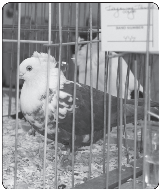
A red Temesberger photographed at the 2009 NYBS, Louisville KY