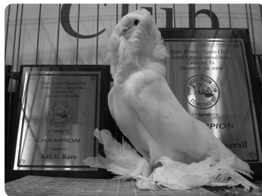
Champion Rare and Champion AOV Saint, white Old Hen #294 (Royal)