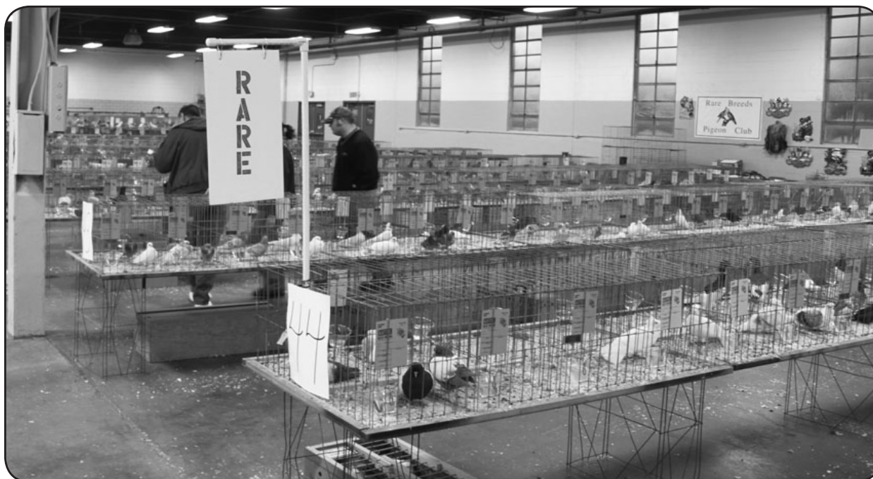
Portion of the Rares section at the NYBS, Louisville KY 2009